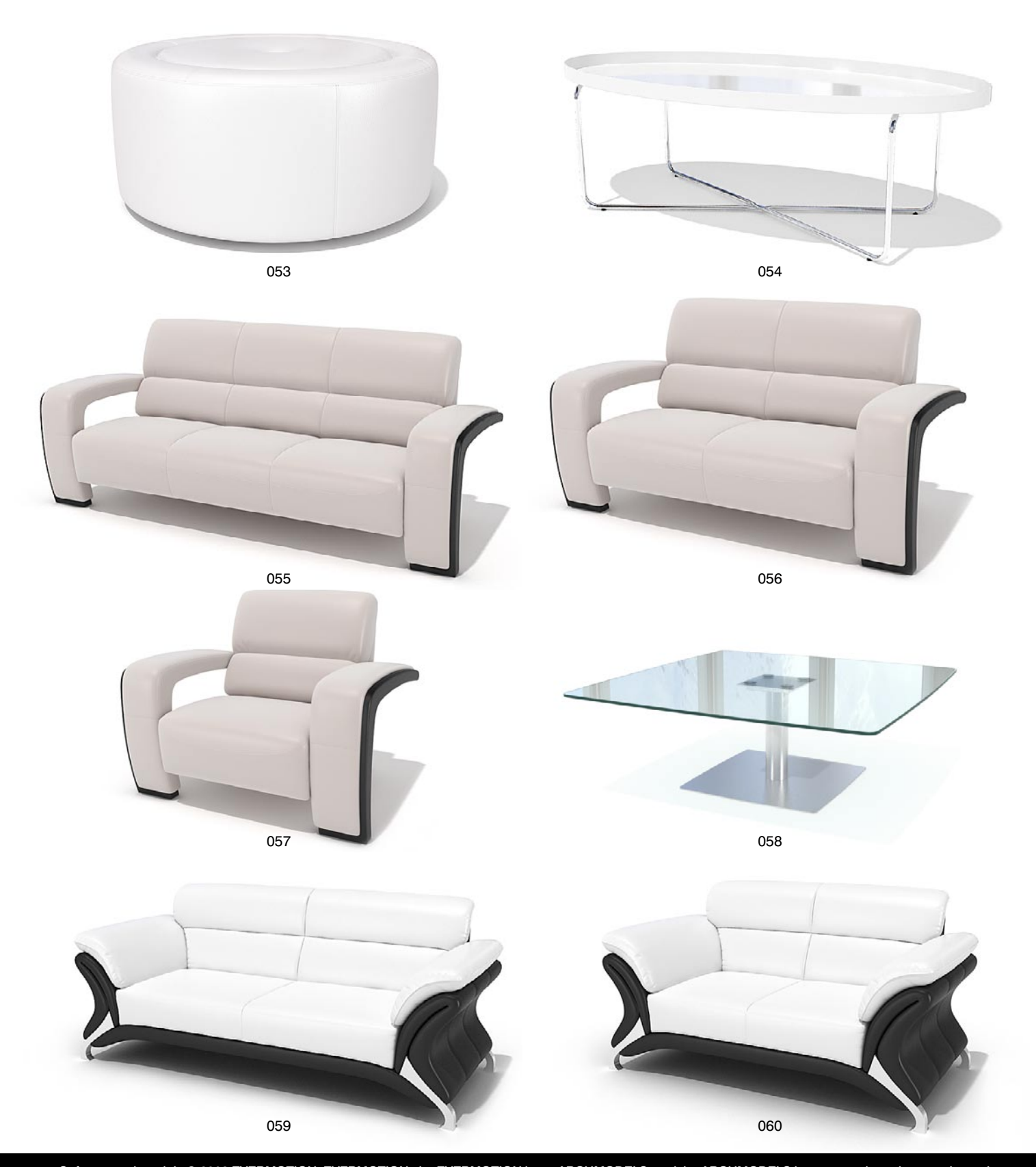
Software and models © 2008 EVERMOTION. EVERMOTION, the EVERMOTION logo, ARCHMODELS, and the ARCHMODELS logo are trademarks or registered trademarks of Evermotion Inc. in the U.S. and/or other countries. All rights reserved. All *.max, *.3ds, *.obj, *.dxf, *.fbx and *.mxs models included on this CDROM with data are an integral part of "archmodels vol.59" and the resale of this data is strictly prohibited. All models can be used for commercial purposes only by owners who bought this CDROM. The sharing of CDROM data is strictly prohibited unless that user has written authorization from EVERMOTION.