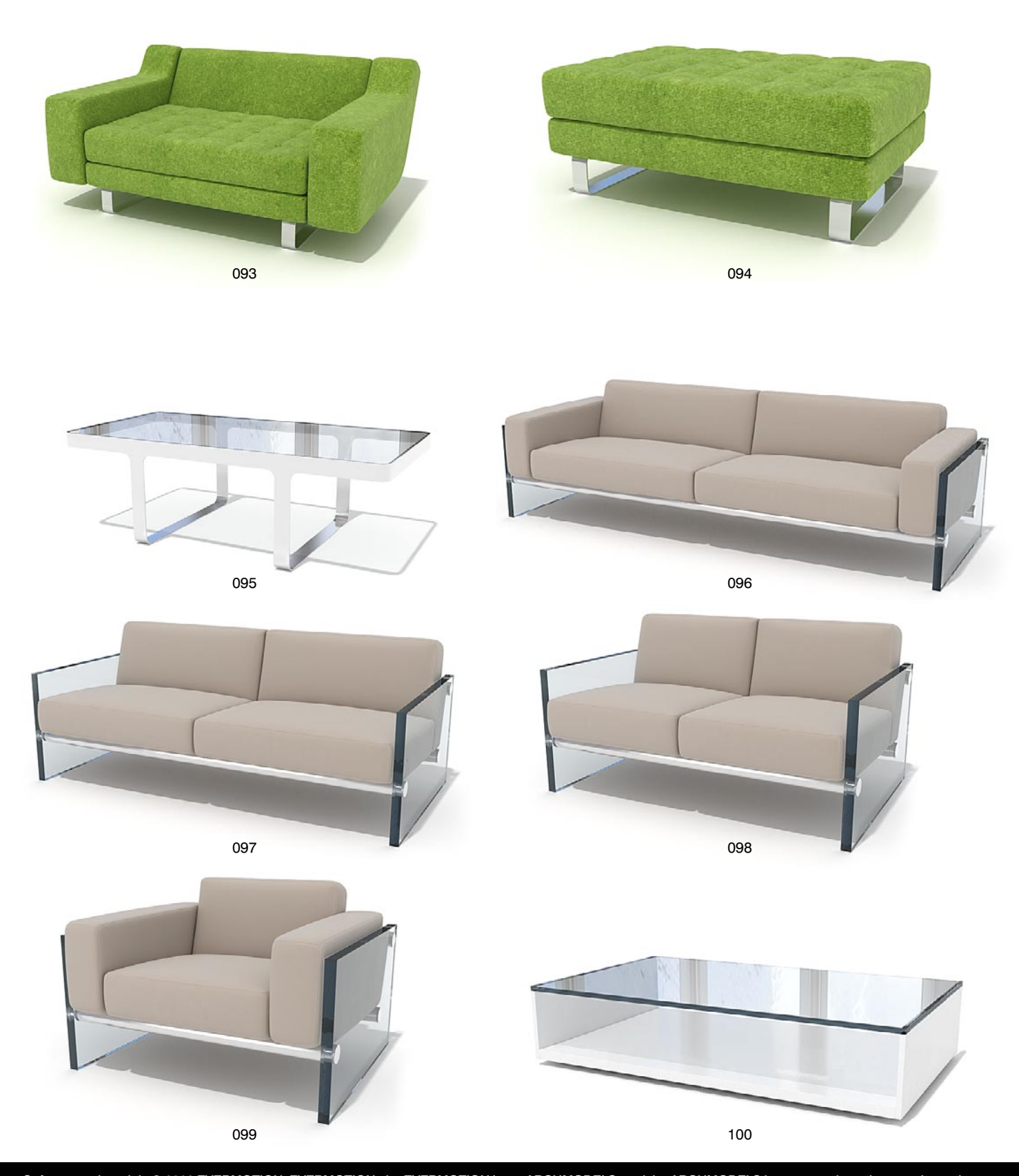
Software and models © 2008 EVERMOTION. EVERMOTION, the EVERMOTION logo, ARCHMODELS, and the ARCHMODELS logo are trademarks or registered trademarks of Evermotion Inc. in the U.S. and/or other countries. All rights reserved. All *.max, *.3ds, *.obj, *.dxf, *.fbx and *.mxs models included on this CDROM with data are an integral part of "archmodels vol.59" and the resale of this data is strictly prohibited. All models can be used for commercial purposes only by owners who bought this CDROM. The sharing of CDROM data is strictly prohibited unless that user has written authorization from EVERMOTION.