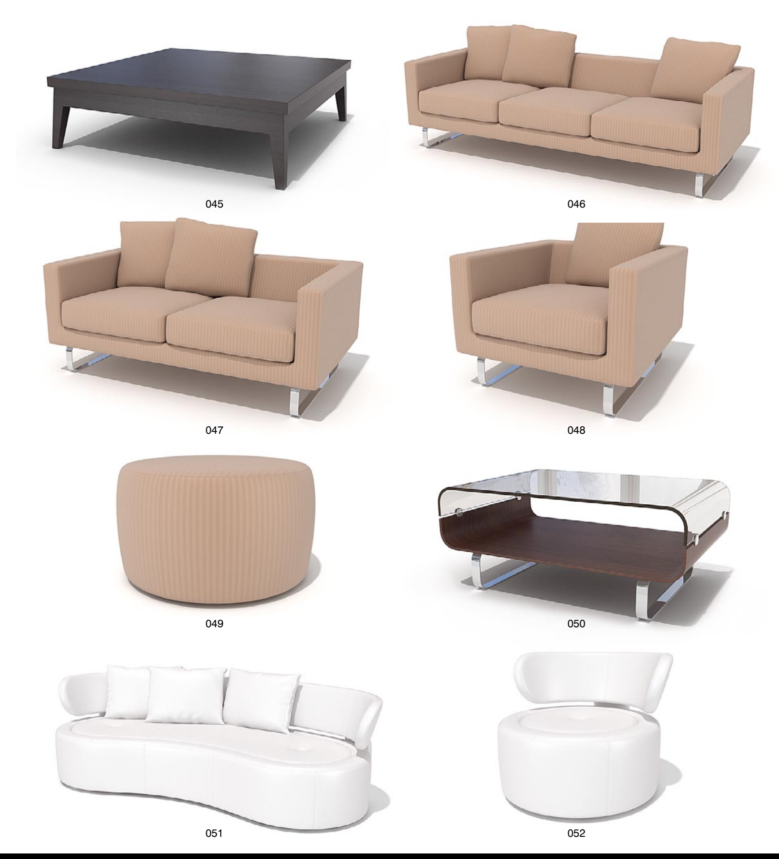
Software and models © 2008 EVERMOTION. EVERMOTION, the EVERMOTION logo, ARCHMODELS, and the ARCHMODELS logo are trademarks or registered trademarks of Evermotion Inc. in the U.S. and/or other countries. All rights reserved. All *.max, *.3ds, *.obj, *.dxf, *.fbx and *.mxs models included on this CDROM with data are an integral part of "archmodels vol.59" and the resale of this data is strictly prohibited. All models can be used for commercial purposes only by owners who bought this CDROM. The sharing of CDROM data is strictly prohibited unless that user has written authorization from EVERMOTION.