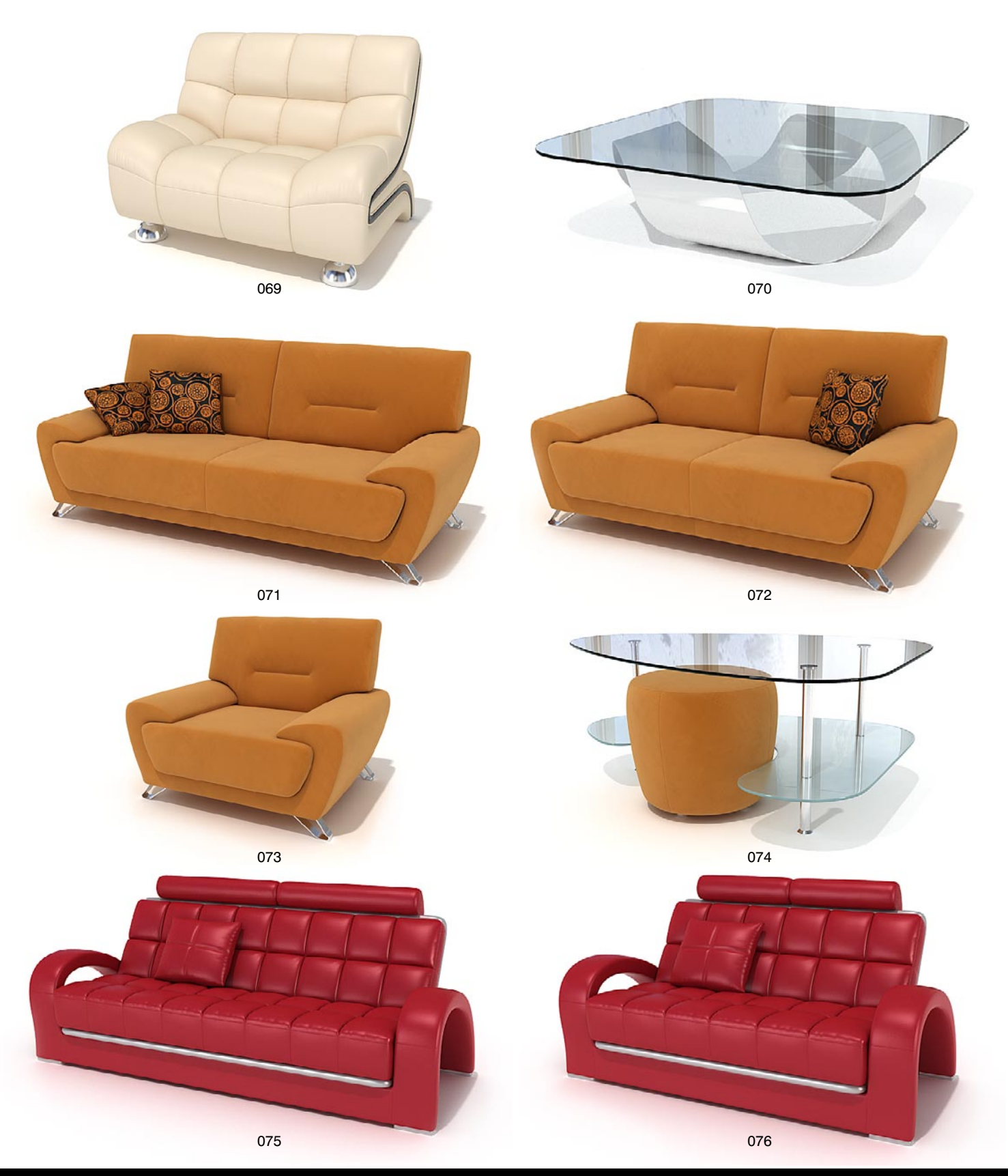
Software and models © 2008 EVERMOTION. EVERMOTION, the EVERMOTION logo, ARCHMODELS, and the ARCHMODELS logo are trademarks or registered trademarks of Evermotion Inc. in the U.S. and/or other countries. All rights reserved. All *.max, *.3ds, *.obj, *.dxf, *.fbx and *.mxs models included on this CDROM with data are an integral part of "archmodels vol.59" and the resale of this data is strictly prohibited. All models can be used for commercial purposes only by owners who bought this CDROM. The sharing of CDROM data is strictly prohibited unless that user has written authorization from EVERMOTION.