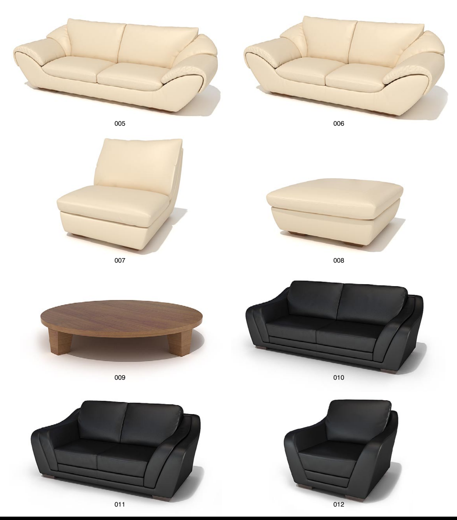
Software and models © 2008 EVERMOTION. EVERMOTION, the EVERMOTION logo, ARCHMODELS, and the ARCHMODELS logo are trademarks or registered trademarks of Evermotion Inc. in the U.S. and/or other countries. All rights reserved. All *.max, *.3ds, *.obj, *.dxf, *.fbx and *.mxs models included on this CDROM with data are an integral part of "archmodels vol.59" and the resale of this data is strictly prohibited. All models can be used for commercial purposes only by owners who bought this CDROM. The sharing of CDROM data is strictly prohibited unless that user has written authorization from EVERMOTION.