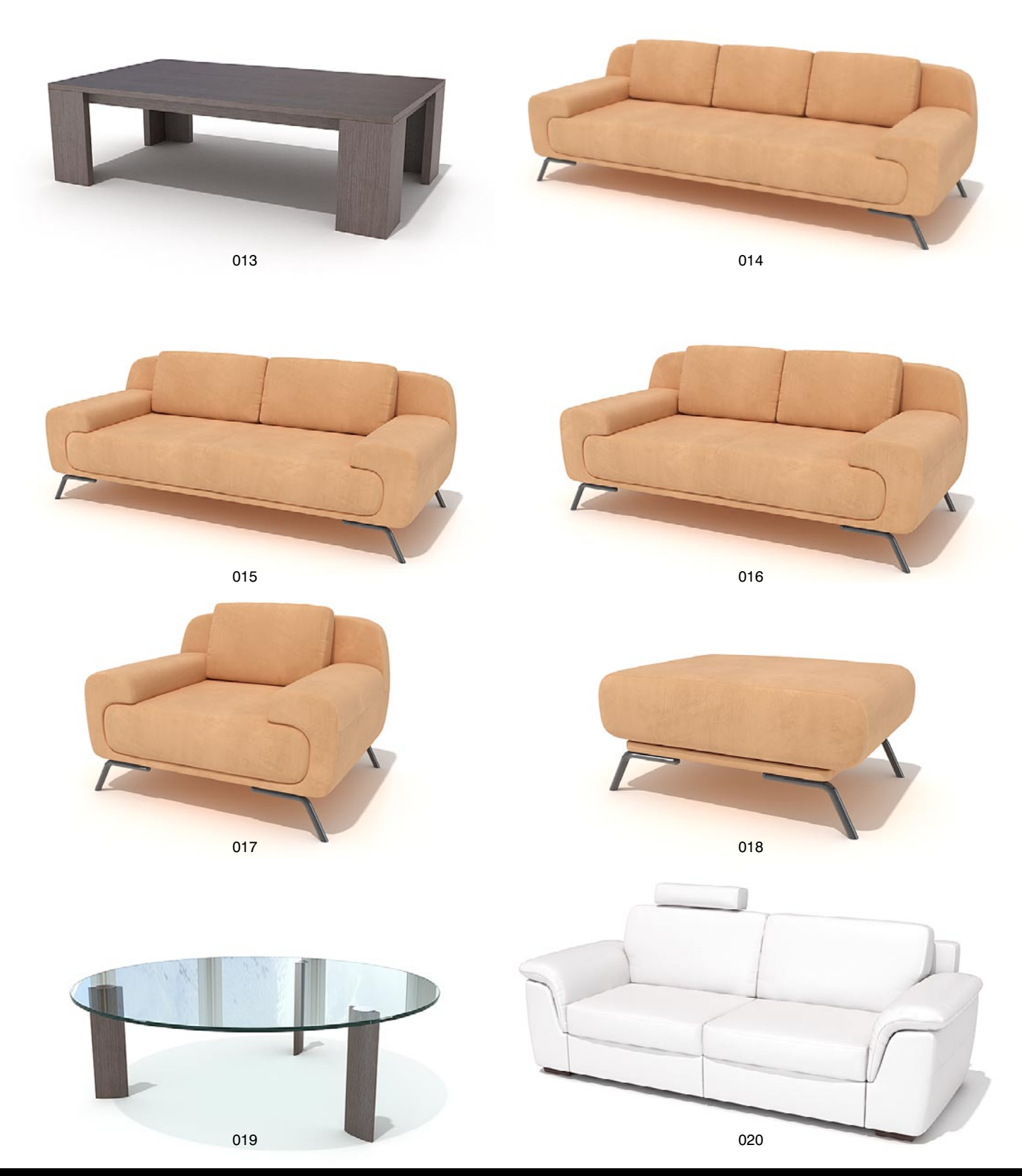
Software and models © 2008 EVERMOTION. EVERMOTION, the EVERMOTION logo, ARCHMODELS, and the ARCHMODELS logo are trademarks or registered trademarks of Evermotion Inc. in the U.S. and/or other countries. All rights reserved. All *.max, *.3ds, *.obj, *.dxf, *.fbx and *.mxs models included on this CDROM with data are an integral part of "archmodels vol.59" and the resale of this data is strictly prohibited. All models can be used for commercial purposes only by owners who bought this CDROM. The sharing of CDROM data is strictly prohibited unless that user has written authorization from EVERMOTION.