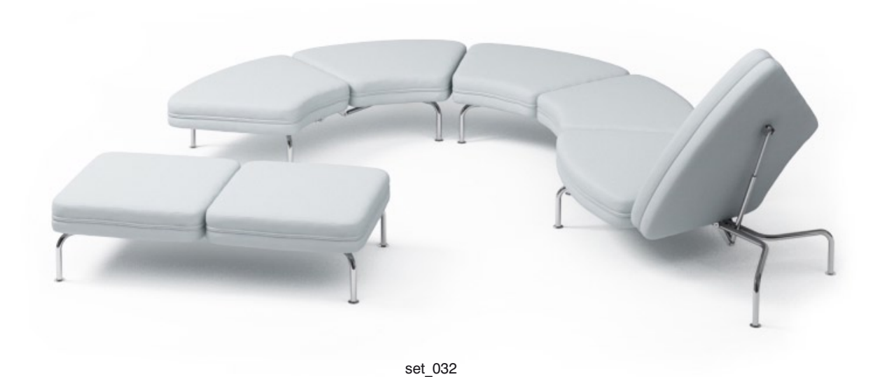
Software and models © 2010 EVERMOTION. EVERMOTION logo is trademark or registered trademark of Evermotion Inc. in the U.S. and/or other countries. All rights reserved. All *.max, *.obj, *.fbx, *.c4d models included on this DVDROM with data are an integral part of "archmodels vol.92" and the resale of this data is strictly prohibited. All models can be used for commercial purposes only by owners who bought this DVDROM. The sharing of DVDROM data is strictly prohibited unless that user has written authorization from EVERMOTION.